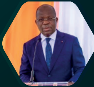
Mr. Pierre N'GOU DIMBA Minister of Health, Public Hygiene and Universal Health Coverage Ivory Coast.