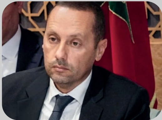
Mr. Amine TAHRAOUI Minister of Health and Social Protection

MINISTRY OF HEALTH AND SOCIAL PROTECTION