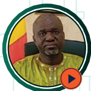
Mr. Babou SENE

The Consul General of the Republic of Burundi in Laâyoune