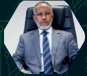
Mr. Abdallahi OULD WEDIH Minister of Health of the Islamic Republic of Mauritania