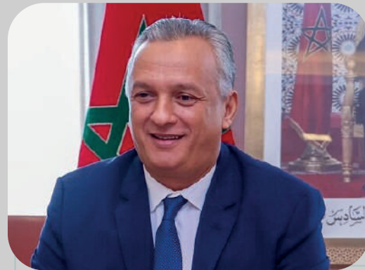
Mr. Karim ZIDANE Minister Delegate to the Head of Government, responsible for Investment, Convergence and Evaluation of Public Policies

THE MINISTRY OF INVESTMENT, CONVERGENCE AND EVALUATION OF PUBLIC POLICIES