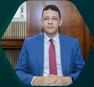
Mr. Ahmed Salem BEDDA ETVAGHA Minister of Digital Transformation and Modernization of the Administration of the Islamic Republic of Mauritania